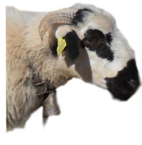
Ovino y Caprino