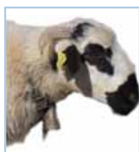
Ovino y Caprino